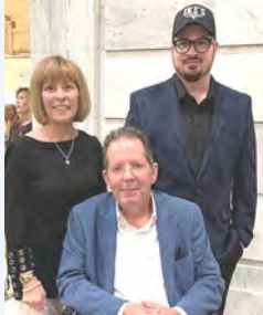
Ike and his par-